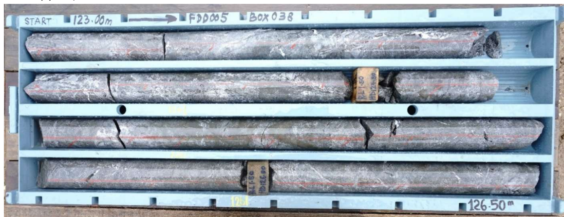
Figure 3: Hole FDD005 from 123.00m to 126.5m -Sulphide rich intrusive zone.