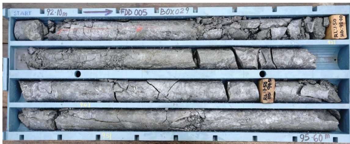
Figure 2: Hole FDD005 from 92.10m to 95.60m - Local semi-massive sulphide zone (20% to 30% pyrite, 2-3% Chalcopyrite)